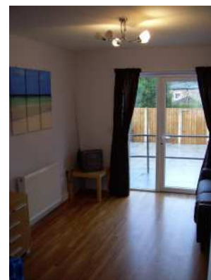
The Sun Lounge

The young people had input into the decoration and personalisation of their bedrooms.